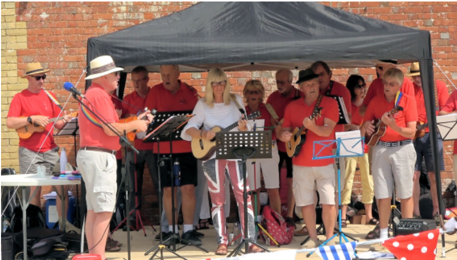
The Romsey Ukulele Band provided live music...

Many people attending the Village Fete on Sunday 14th August said how pleased they were to see it happening again, after the break forced on us by the pandemic. Although the numbers were a little lower than hoped for, quite possibly due to the extreme heat, it turned out to be a most enjoyable afternoon.