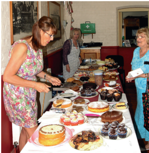
Cakes selling like, er, hot cakes at the fete