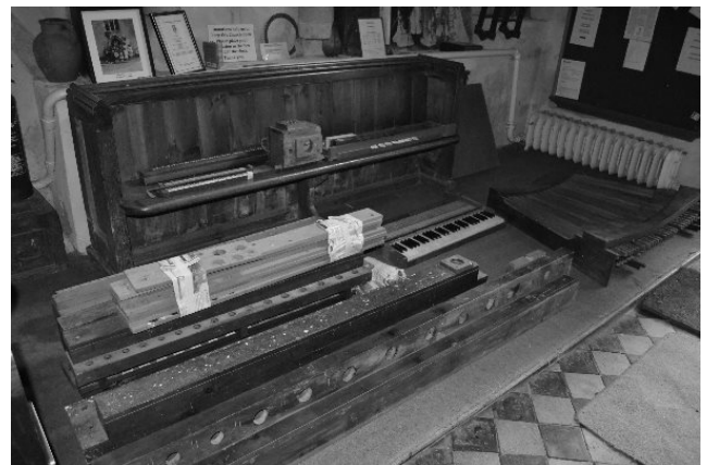
(Continued on page 7)

rare small pipe organ which he tells us was once