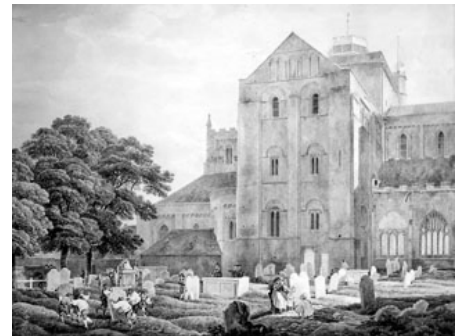
Michael 'Angelo' Rooker's watercolour of Romsey Abbey

The latest exhibition in the Art Gallery is Watercolour, which runs from Saturday, 4 May to Sunday, 30 June. Artists have been using watercolour for centuries, from rapid sketches that capture atmosphere and colour to complex, expressive works that push the medium to its limits.