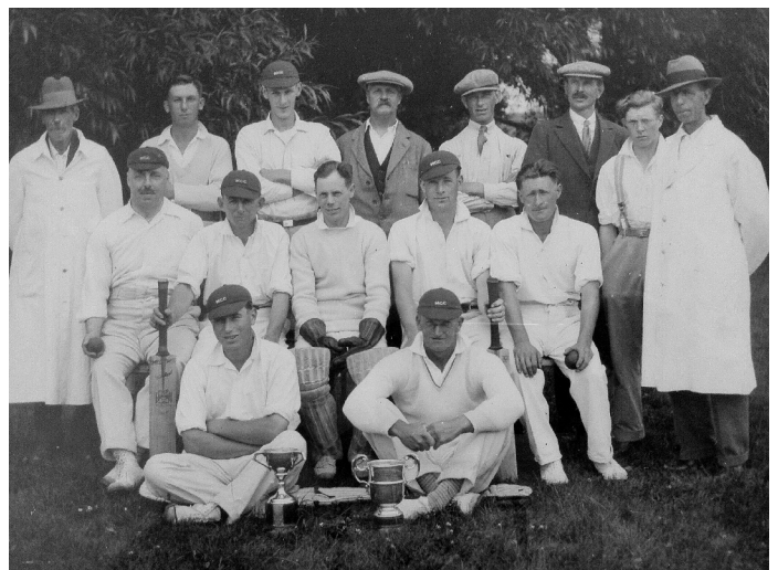
The fine fellows of the 1931 Mottisfont cricket team, sporting an interesting selection of hats!