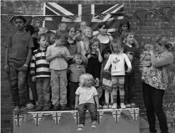
Lots of winners on the rostrum...

The Village Jubilee Olympicnic on Monday, 4th June proved to be a great success. The weather held as young and old from the community came to the Village Hall for an afternoon of fun and games - of the traditional kind!