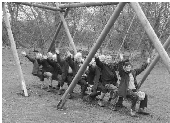
Last months walkers enjoying the facilities of the Longstock playground