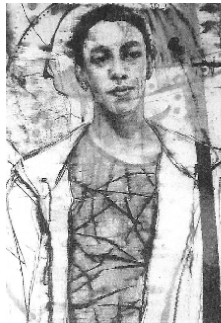
An example of Julia Polonski's work