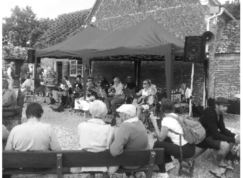
The Birnie Boozle Band enjoying playing to the crowds at the annual Mottisfont Fete

A lot of people helped in the set up, running games, manning stalls, selling teas and ice creams, beer and burgers, etc. There was a wonderful community spirit and a lot of people came.