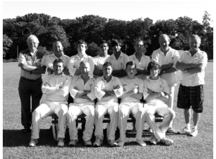
Members of the Mottisfont Cricket Club Team 2011

The Club is always looking for new players, helpers, supporters or benefactors, so feel free to pop along on a Tuesday or a Saturday to support your local team next summer.