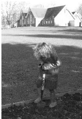
Hard work in the veg. patch

We have had a wonderful half term of exciting learning at Awbridge. The children in years R, 1, 2 and 3 have continued to enjoy their weekly gardening sessions and have been working very hard digging up the vegetable patch in all weathers ready to plant some new and lovely fruit trees. The children will be planting apple, cherry and plum trees along with raspberry canes and blueberry bushes and we're all very excited about it! These will blossom in spring time, provide fruit for us to harvest, and will also attract wildlife into our wonderful environmental area. They are also planting seeds from the broad beans that they harvested last year!