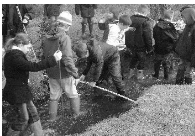
Close study of a river!

Years 4, 5 and 6 children have been off site on educational visits to enhance their learning. Class 4 visited INTECH as part of their topic on electricity. They took part in electricity workshops and they impressed the centre with their outstanding knowledge of circuits and their explanations on how they work. We were also really lucky that an employee of IBM came in to share his expertise on how circuits are made, and the whole class was buzzing with excitement!