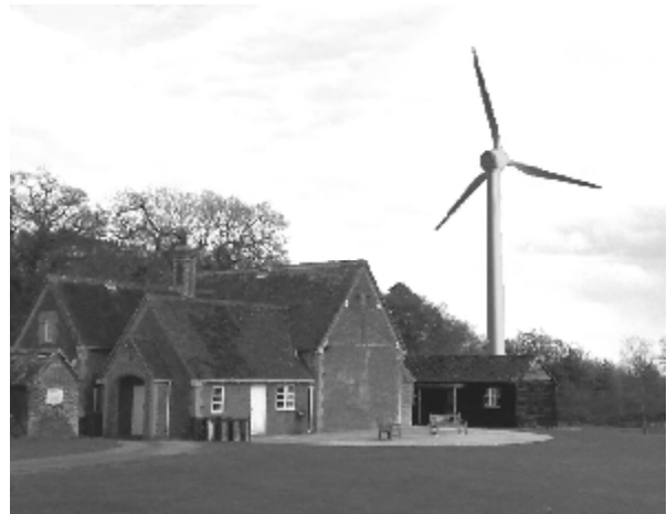
How a wind turbine would look next to the village hall

Mottisfont and Dunbridge are poised to be at the forefront of this 21st century development. Local intelligence has uncovered plans to place a wind turbine farm close to the village hall. Following a lengthy closed planning meeting between councillors and a consortium of unidentified local businessmen, plans are understood to be in development to raise significant funding for this controversial scheme ( watch out for news of fundraising quiz evenings and a possible Tandoori night? - Eds. ).